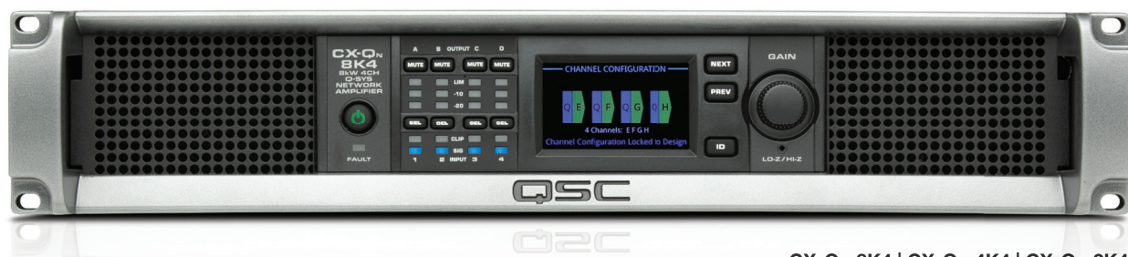
CX-Qn 8K4 | CX-Qn 4K4 | CX-Qn 2K4